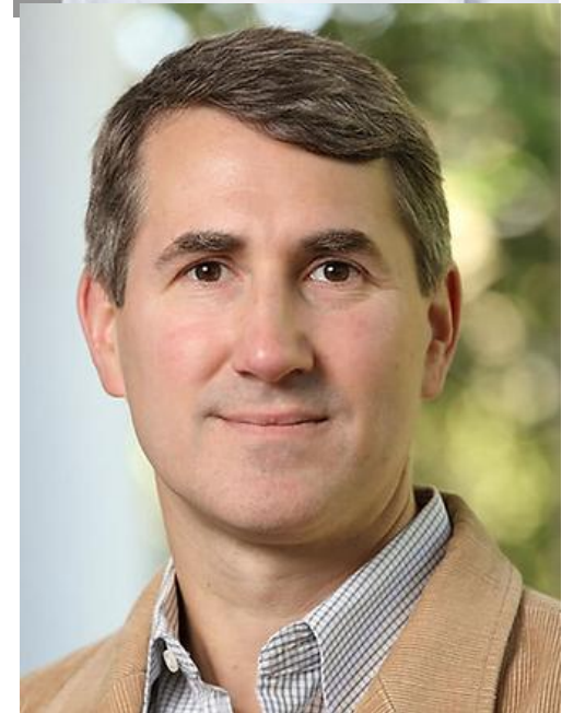
Michael Porter, PhD